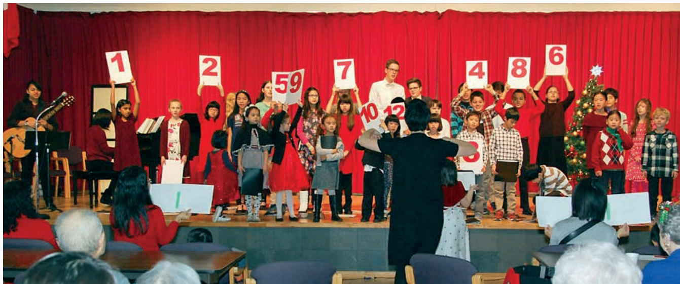
Shine Home Schooling Students

Please visit our website ( momiji.on.ca ) or follow us on Facebook ( facebook.com/momijihealthcaresociety ) for information on these events and many more.