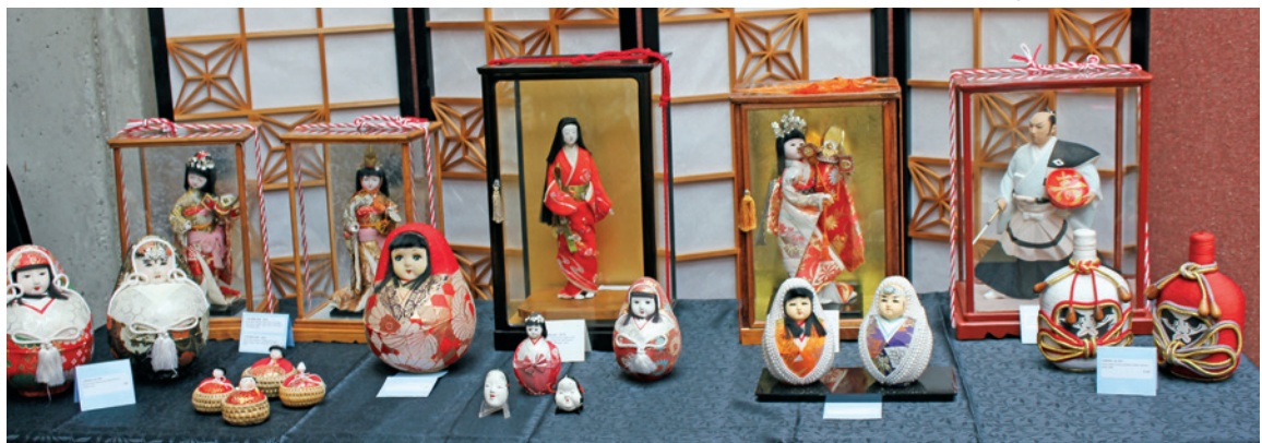
Our beautiful Ningyo were a popular item