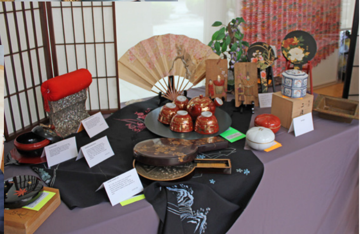
A new addition - our Japonica Room