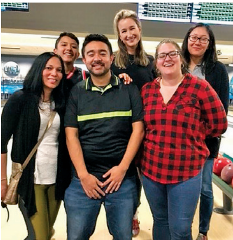
Team 900 Bowling Pro Shop

Our annual Bowlathon continues to be one of Momiji's most successful (and most fun!) fundraising events and this year was no exception. This Family-Friendly Event has had participation from many of our Momiji Seniors (unfortunately, less than in previous years gone