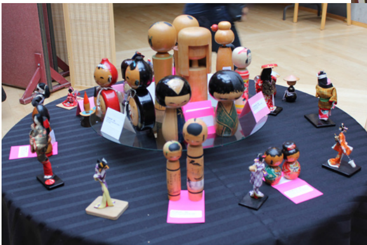
There were lots of cute Kokeshi for sale